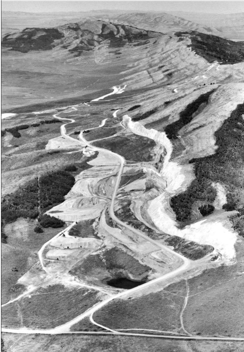
Figure 121. Blackfoot Narrows Mine, view north, 1975.

According to an unpublished Bureau of Mines report dated September 12, 1967, surface structures at the mine included railroad-loading facilities with weigh scales for scrapers, two buildings and two trailers. The phosphate rock was loaded directly into scrapers which were pushed by bulldozers. Each scraper carried about 50 tons of ore to the stockpiles at the rail loading facilities. Front end loaders moved ore from the stockpiles to rail cars.