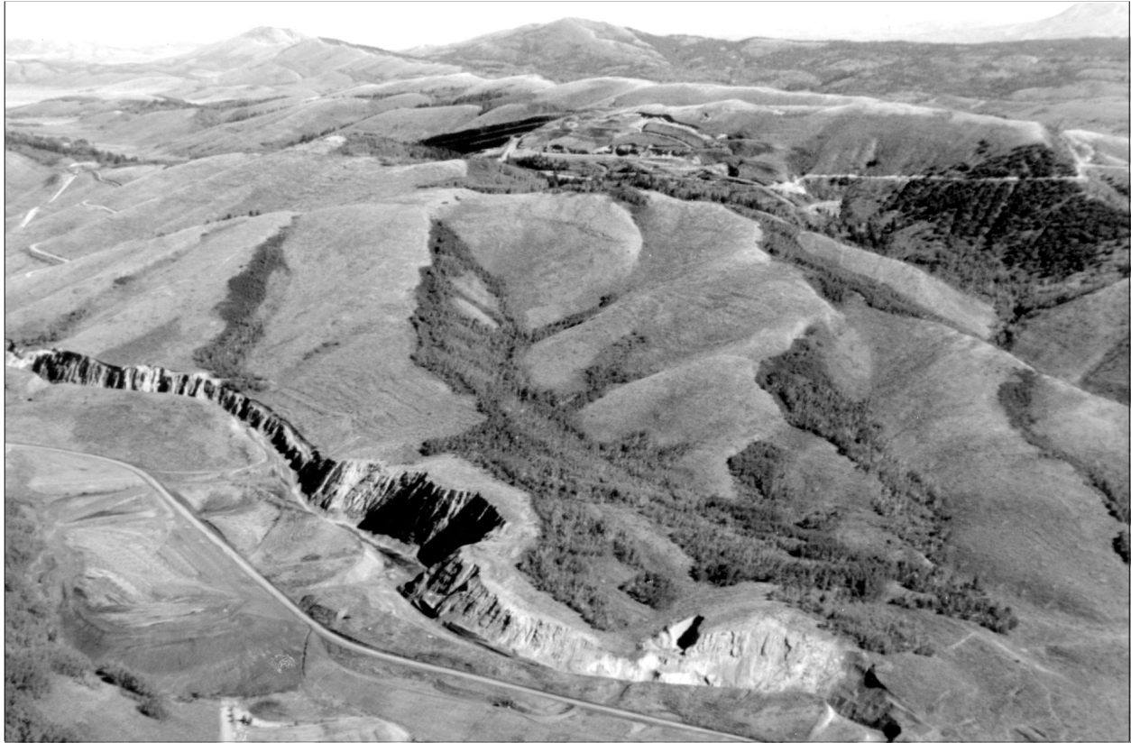
Figure 122. Blackfoot Narrows Mine, August 19, 1978.