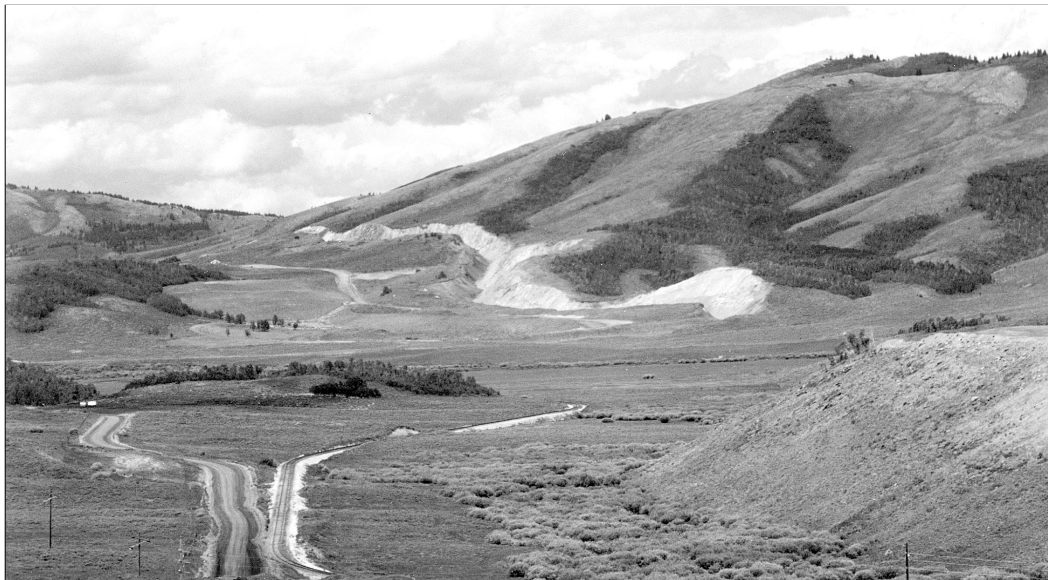
Figure 123. Blackfoot Narrows Mine, view north, June 27, 1996.